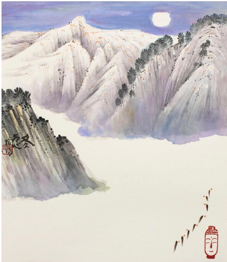
Ven. Shi De, 冬忍 ( Winter Fortitude ), 2022. Mixed media on Xuan Paper, 17.25 x 15.25 in (40 x 34 cm).

November 22, 2022 (Palo Alto, CA) - Qualia Contemporary Art is pleased to announce Solace , a group exhibition of new works by the Venerable Shi De and artist Joe Ferriso. The show explores the practice of art making as it relates to the artist's journey toward personal and spiritual contentment. Artists are often depicted as solitary figures, yet the fruits of such isolation in the